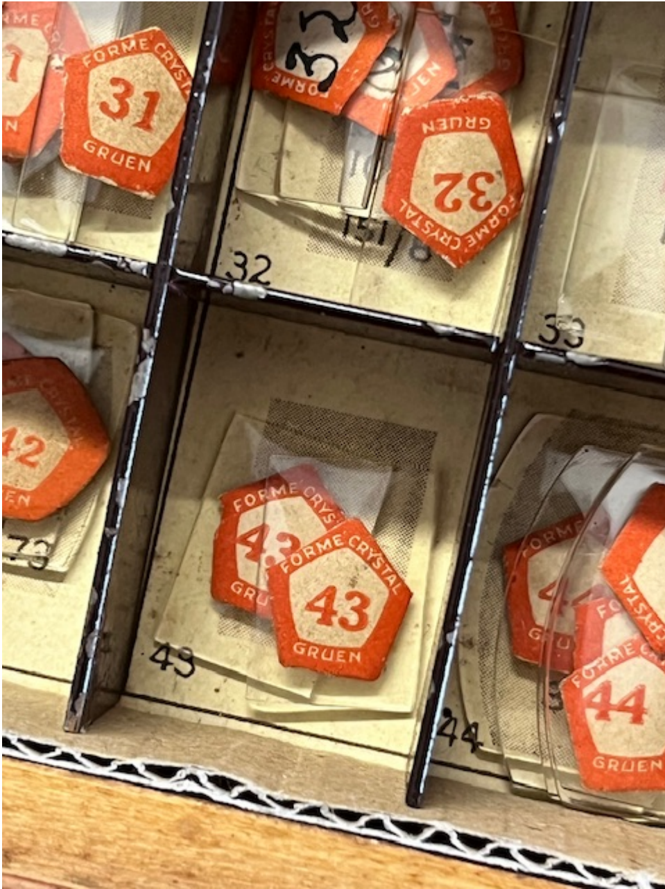
2) IMG_2084.jpeg , downloaded 525 times