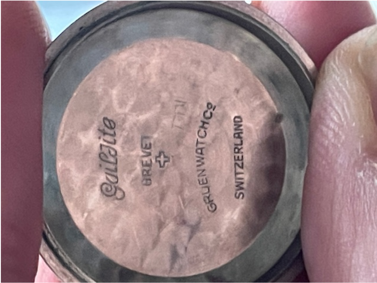
5) IMG_7579.JPG , downloaded 2088 times