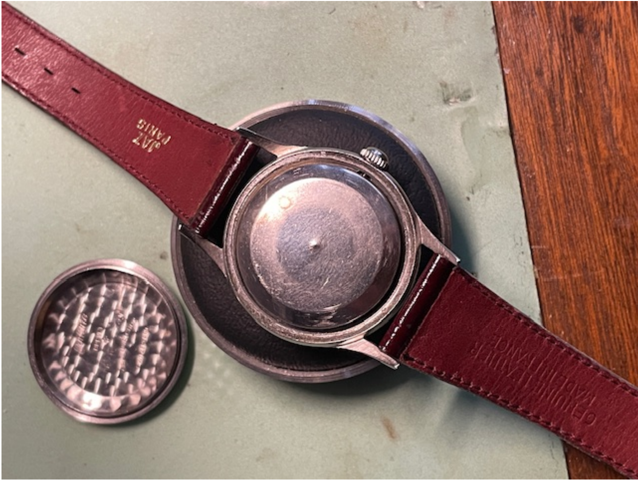
4) IMG_7580.JPG , downloaded 2076 times