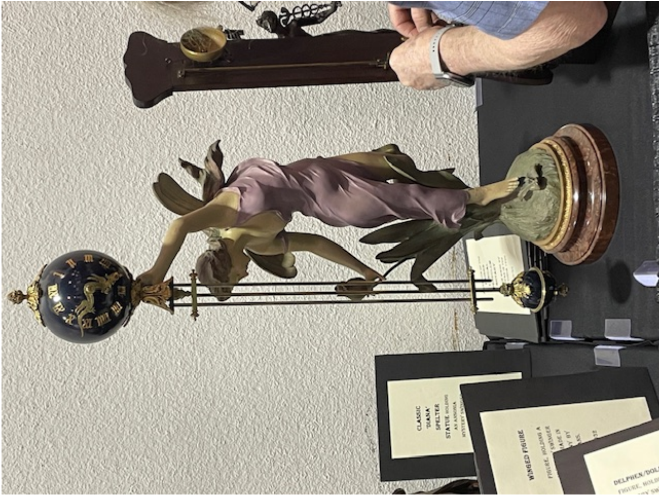
3) IMG_7945.JPG , downloaded 94 times