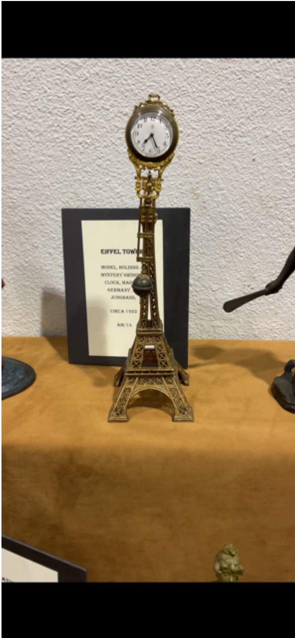
2) IMG_7949.JPG , downloaded 95 times