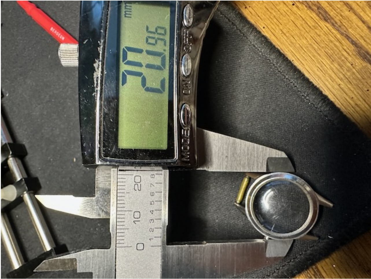
3) IMG_9536.jpeg , downloaded 198 times