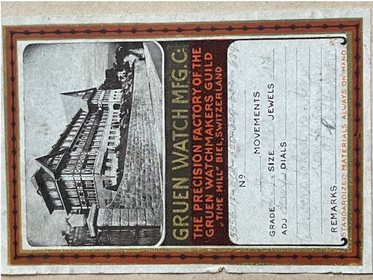
5) IMG_7869.JPG , downloaded 169 times