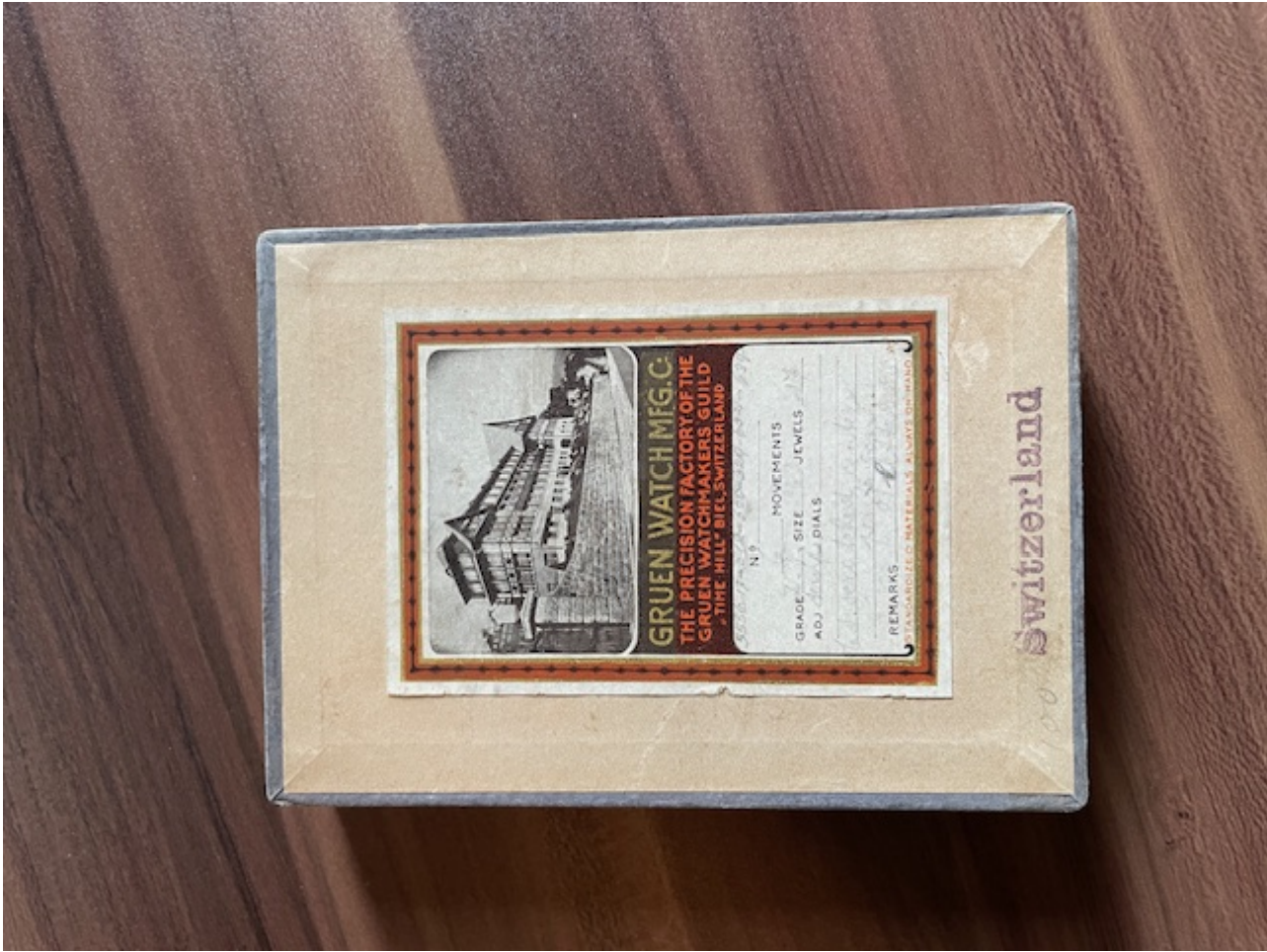
3) IMG_7868.JPG , downloaded 171 times