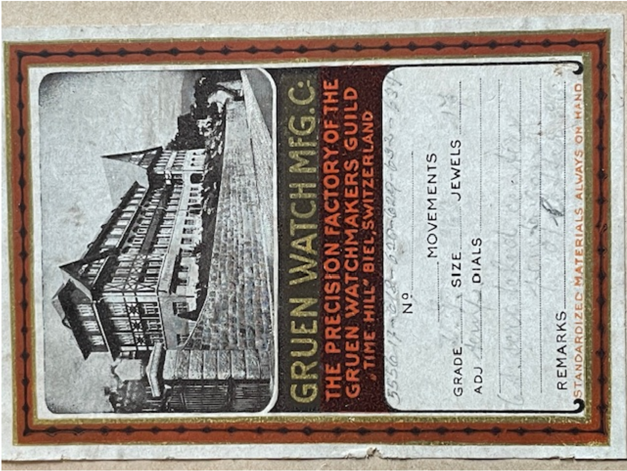
5) IMG_7869.JPG , downloaded 1881 times