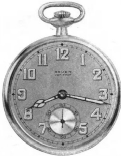
PLATE 22A GRUEN MILITARY POCKET TIMEPIECE

Patented radium dial. Case has inside double protection cap. Meets the highest timekeeping requirements. In 14 kt. gold case and in Ultra Quality Gold Filled.