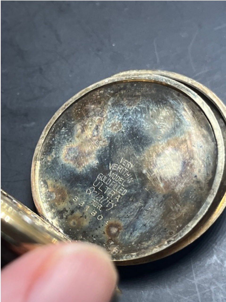
5) IMG_4706.jpeg , downloaded 1773 times