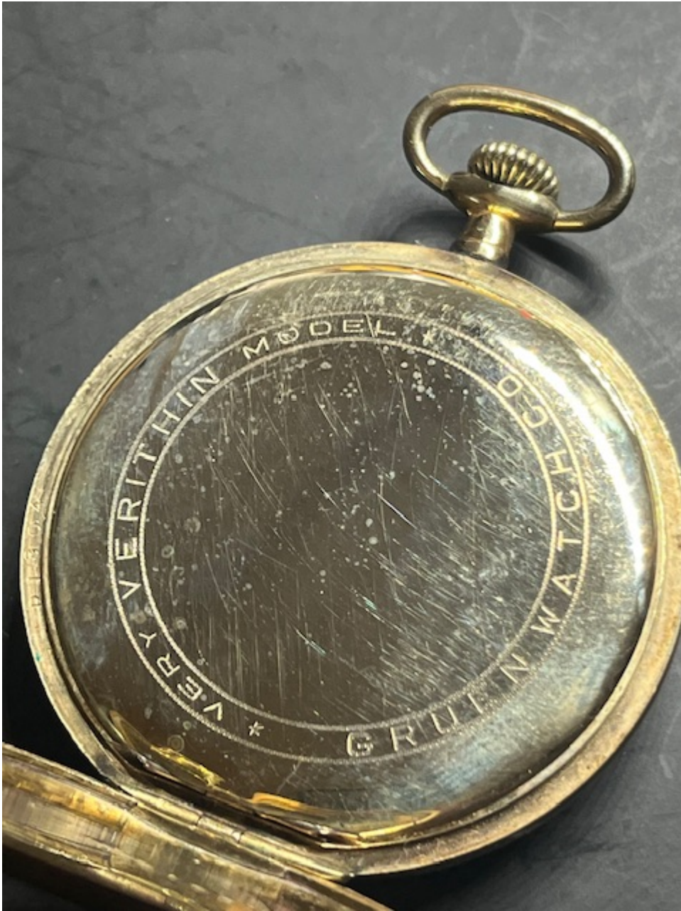
4) IMG_4705.jpeg , downloaded 1770 times