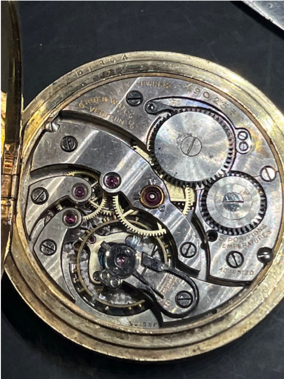
6) IMG_9288.jpeg , downloaded 1749 times