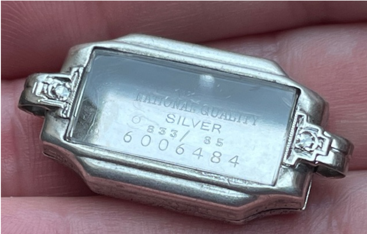
3) IMG_5085.jpeg , downloaded 1563 times