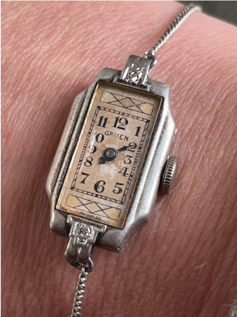
2) IMG_5084.jpeg , downloaded 1624 times