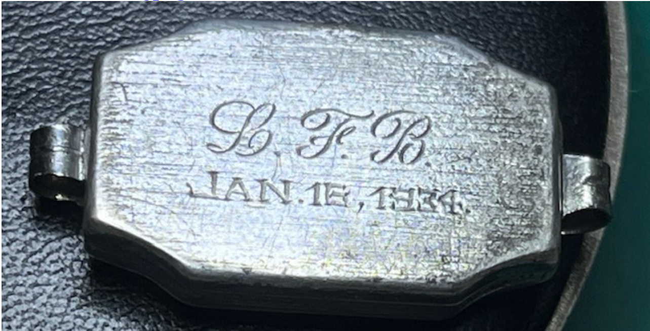
4) IMG_5076.jpeg , downloaded 1579 times