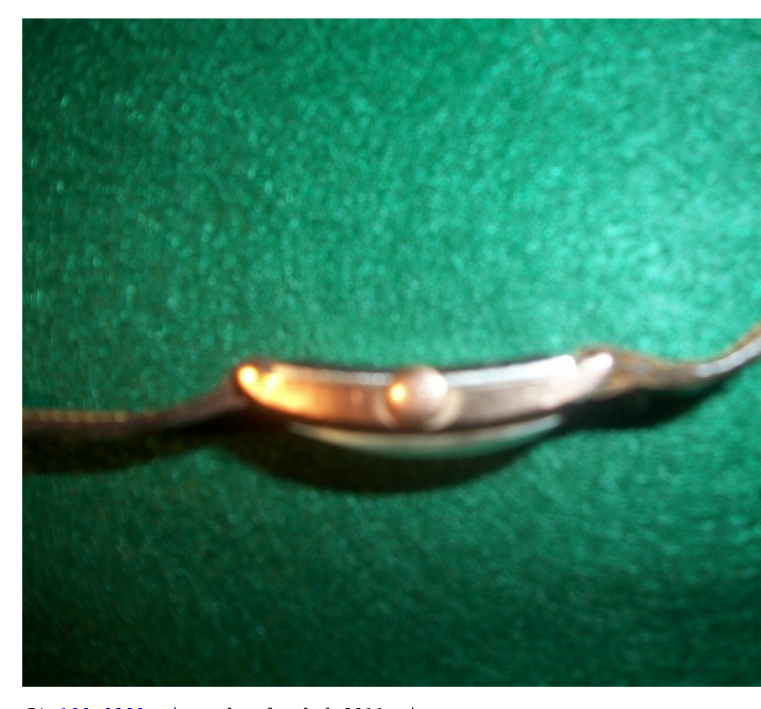
5) 100_0329c.jpg, downloaded 2011 times