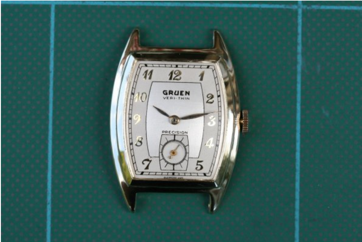
2) Img_3348.jpg , downloaded 2105 times