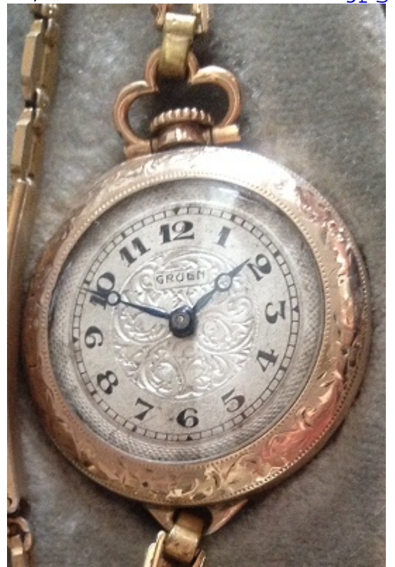
3) D6A7155A-3777-434B-B15F-C11B7DD80FCF.jpeg, downloaded 1717 times

2) Convertible front.jpg, downloaded 1928 times