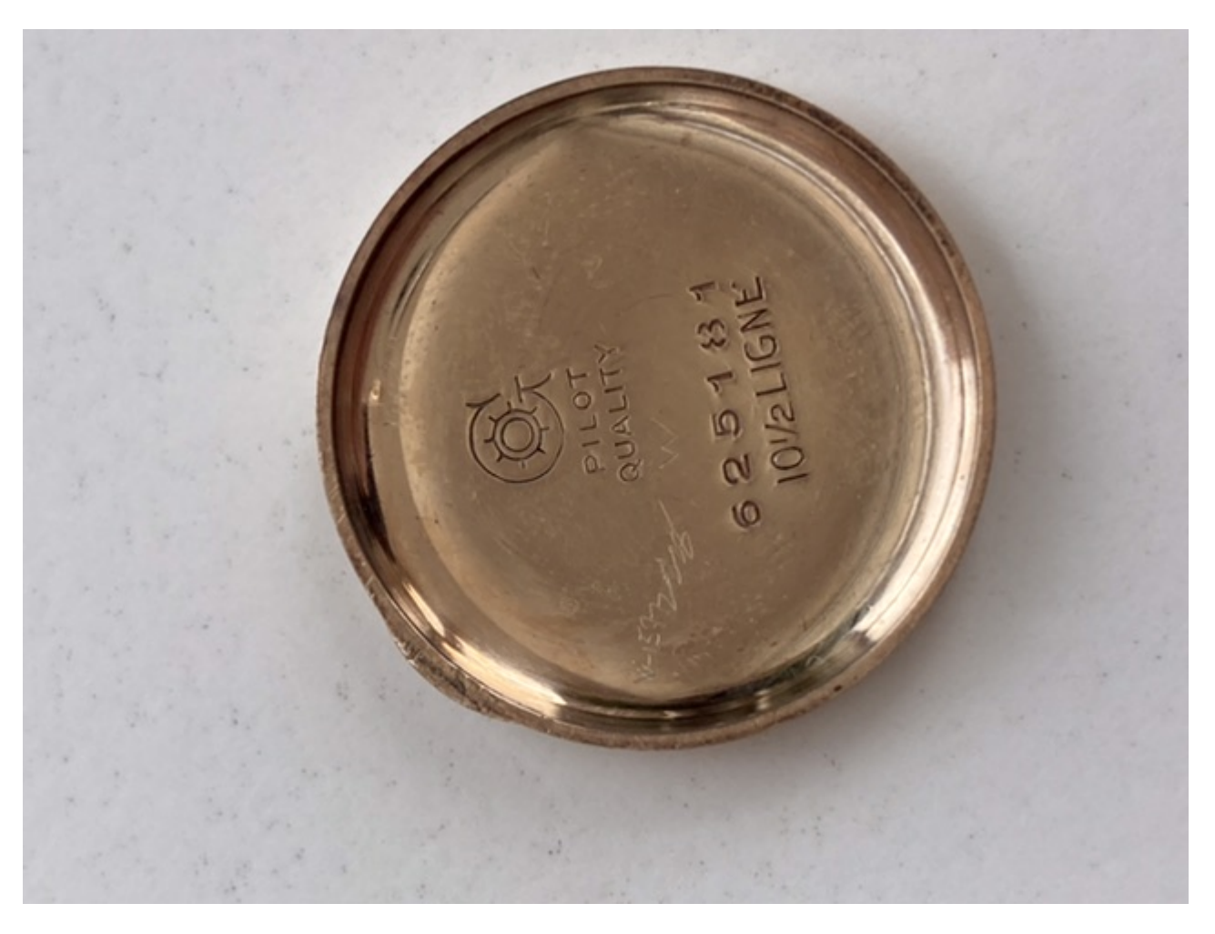
5) 39AFFCDB-4D4A-489E-A0AD-D89642D5D854.jpeg, downloaded 1672 times