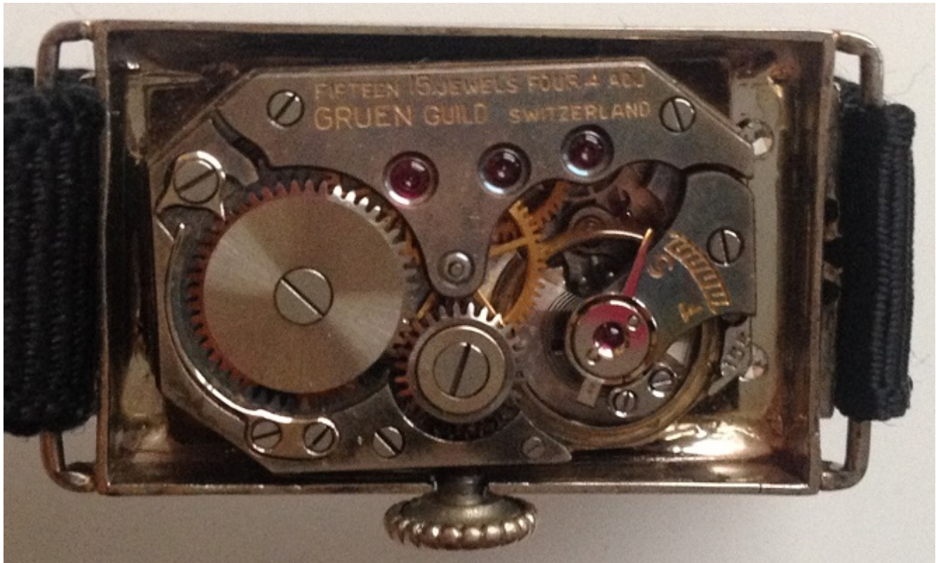
4) Car 255 Back.jpg , downloaded 2086 times