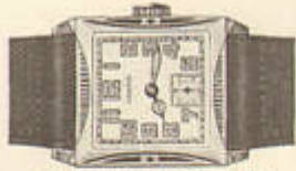
Gruen wrist watch, 15-jewel, $35. Other designs, $175 to $27.50