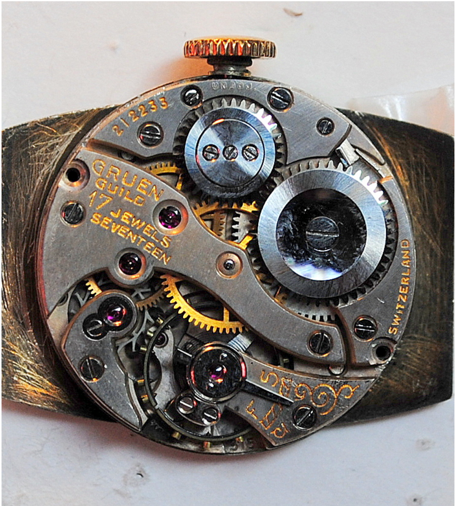
2) Gruen 315_3 top plate.JPG , downloaded 1970 times