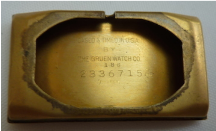
3) Tilton complete.JPG , downloaded 1360 times