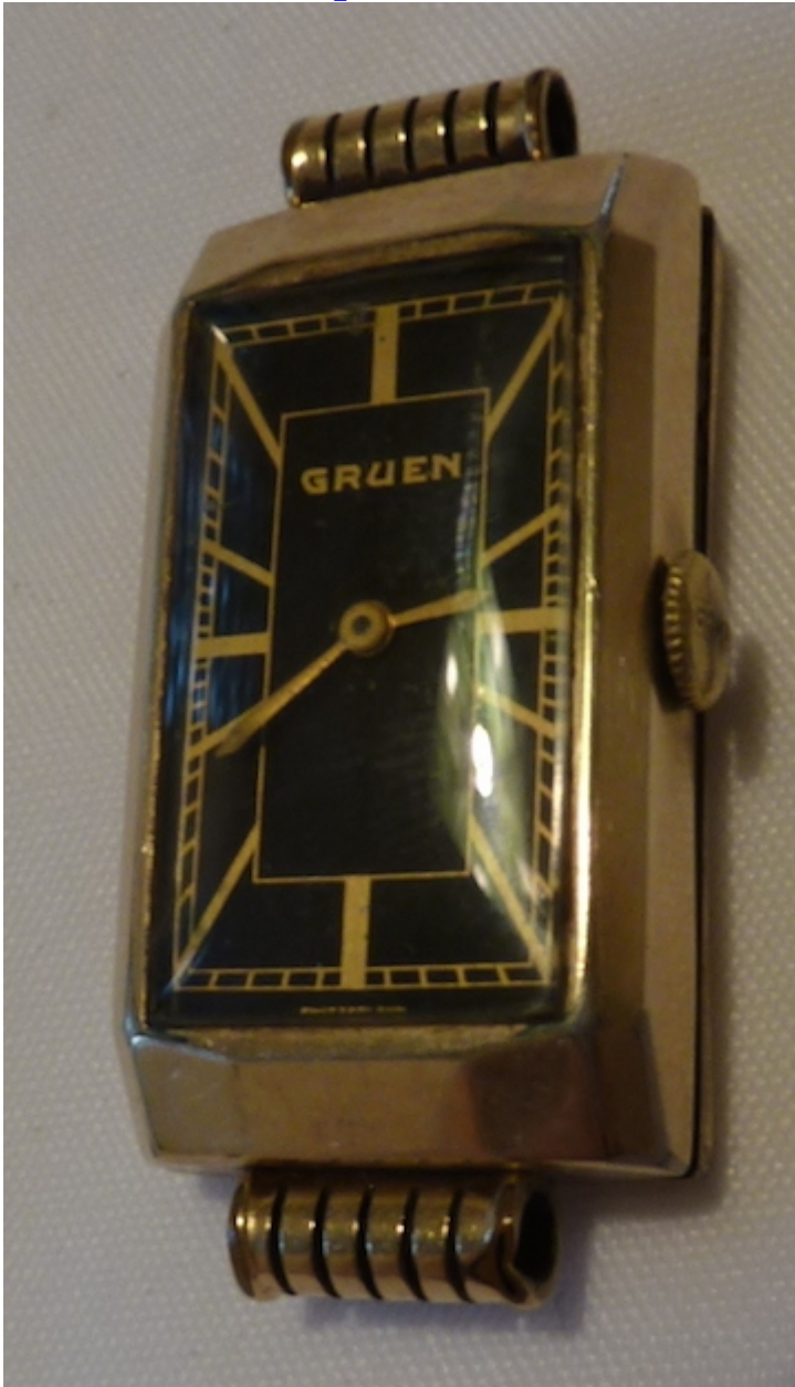
4) Tilton face.JPG , downloaded 1107 times