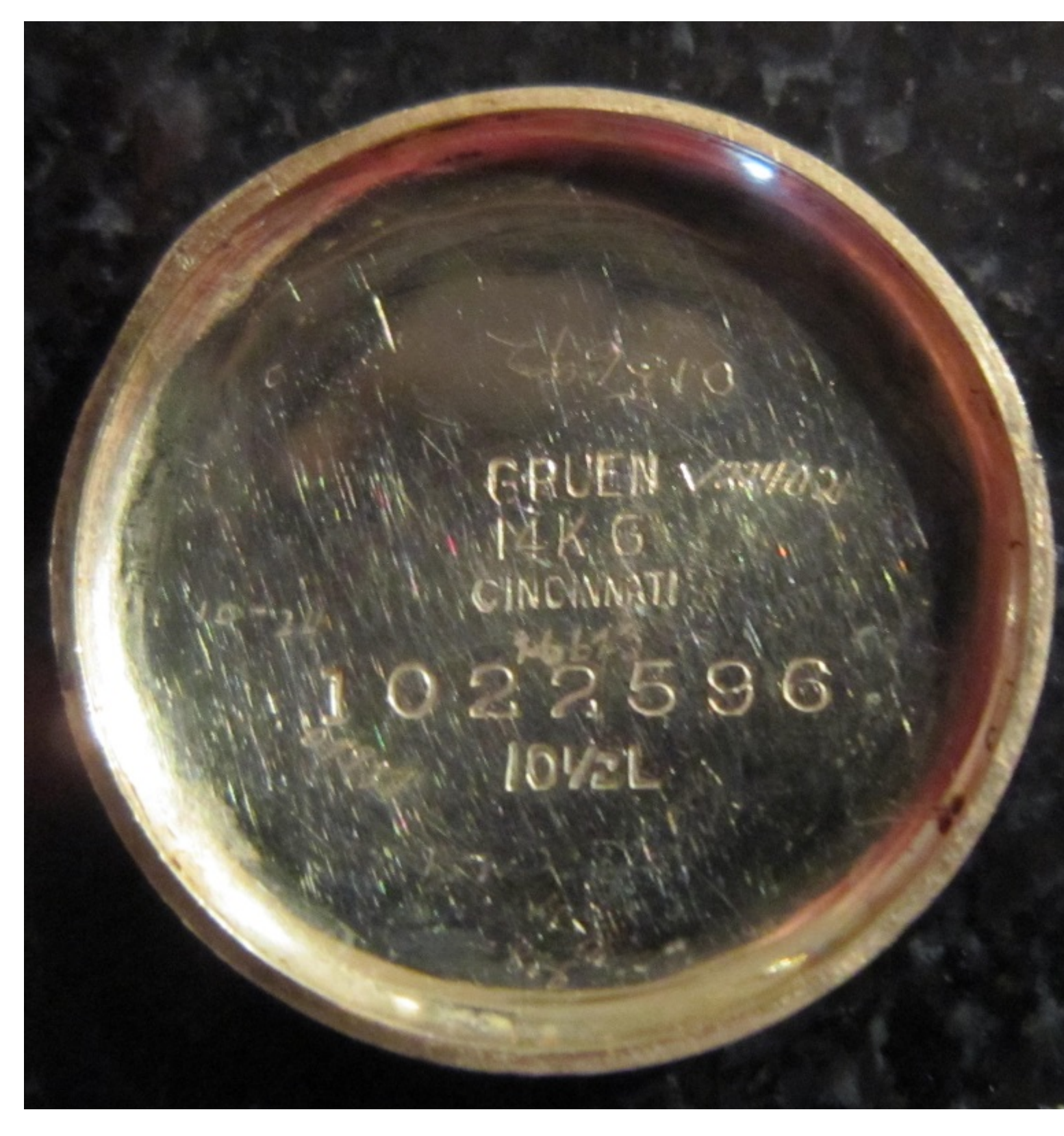
3) movement_res.jpg, downloaded 1855 times